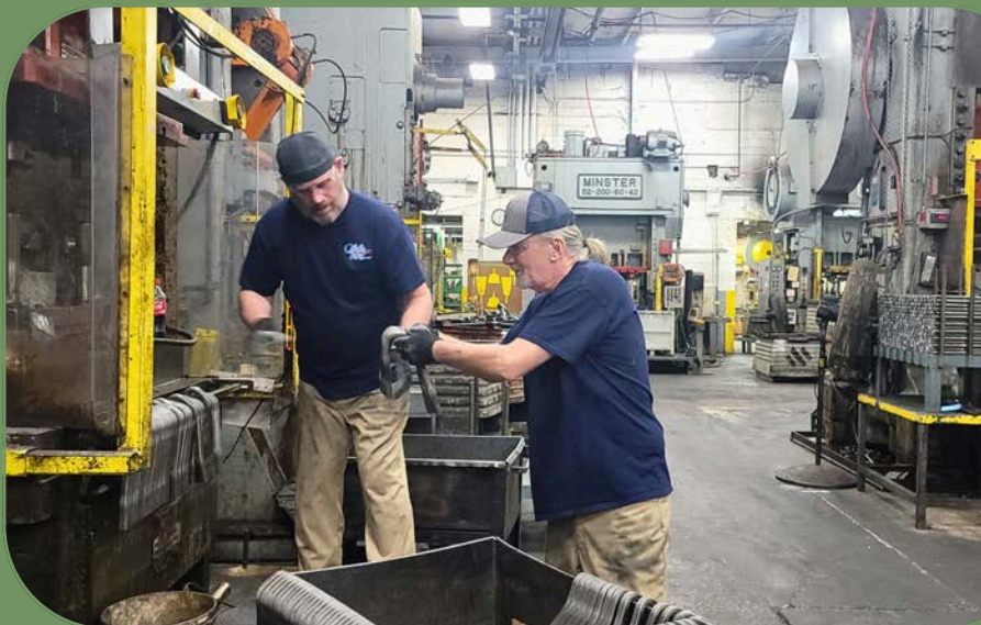
Midwest Fabricating employees pictured cold forming steel into fasteners and custom wire formed rods at the plant located in Amanda, Ohio.